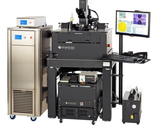
SA-8 semiautomatic probe system with a -65'C to 300'C thermal chuck, localized environmental chamber, compound optics, HF manipulators mounted on a vibration isolation table - several configurations available.

All SemiProbe semiautomatic and fully automatic systems operate on the powerful PILOT control software suite, designed employing the same adaptive architecture philosophy as the PS4L hardware. PILOT is modular, intuitive and easy to learn. Additional control modules for added features and accessories can be implemented without changes to the core control software. Common functions such as 2 point alignment are wizard-based for easy operation - even for the occasional user. For setup or occasional users, the software can be bypassed and total control moved to a local joystick.