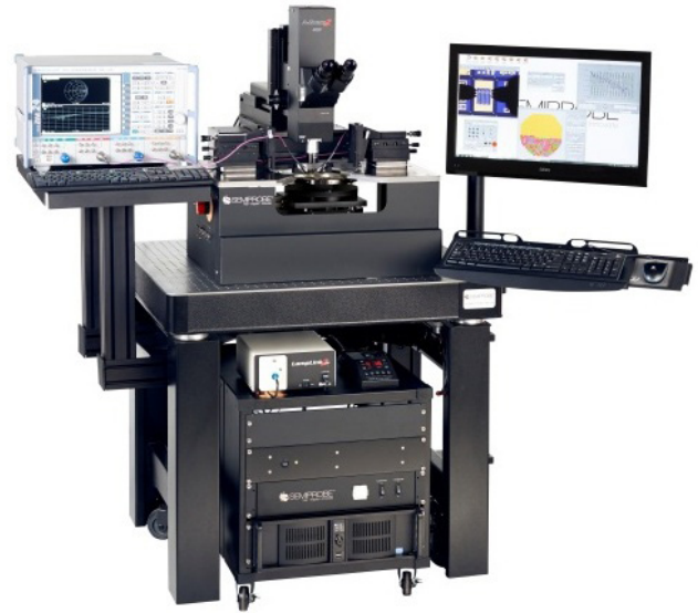
SA-6 semiautomatic probe system with compound optics, HF manipulators mounted on a vibration isolation table - several configurations available.

All SemiProbe semiautomatic and fully automatic systems operate on the powerful PILOT control software suite, designed employing the same adaptive architecture philosophy as the PS4L hardware. PILOT is modular, intuitive and easy to learn. Additional control modules for added features and accessories can be implemented without changes to the core control software. Common functions such as 2 point alignment are wizard-based for easy operation - even for the occasional user. For setup or occasional users, the software can be bypassed and total control moved to a local joystick.