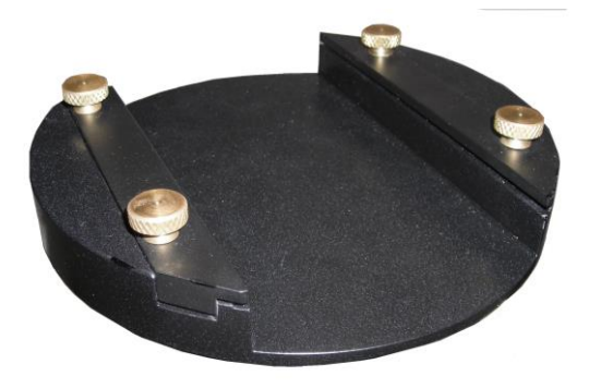
Option 4 User starts with an HF chuck and then addes the required Packaged Part Adapter